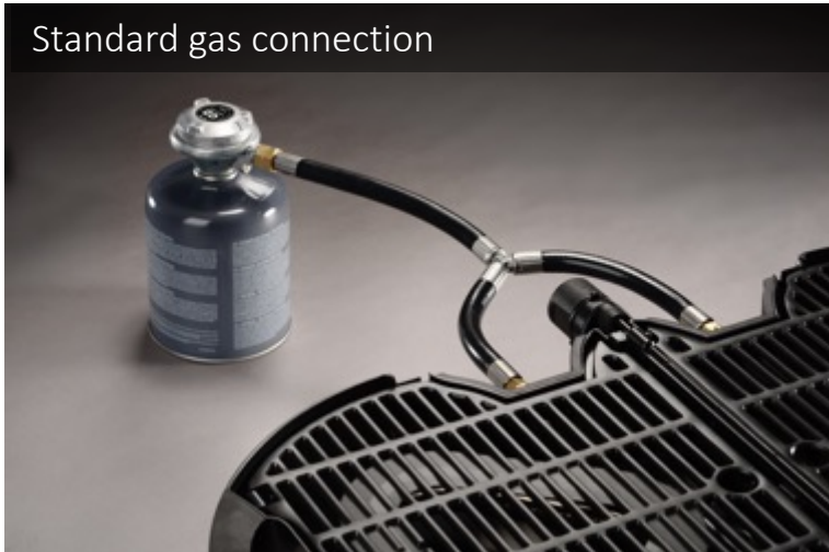
Standard gas connection