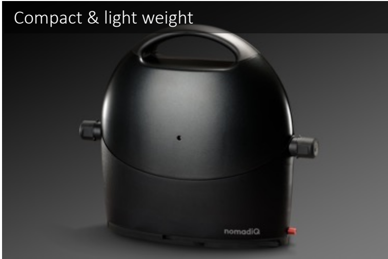
Compact & light weight