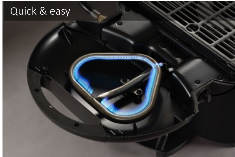
Quick & easy