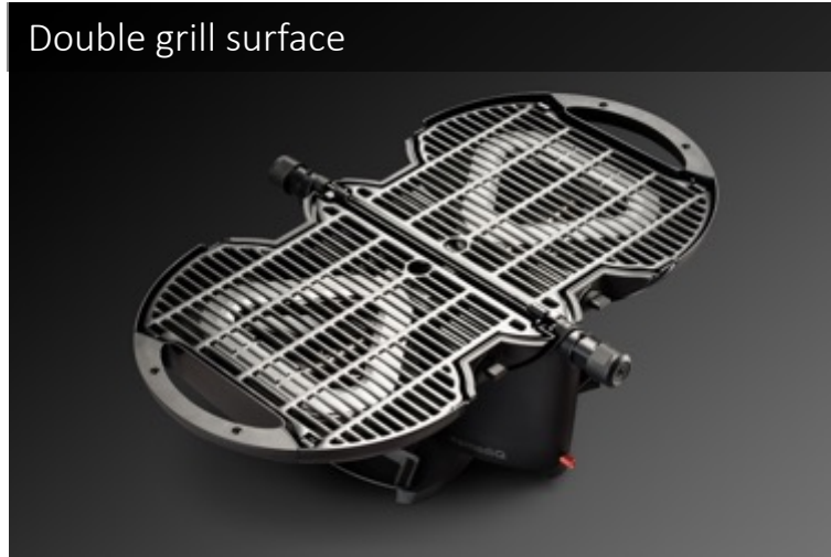
Double grill surface